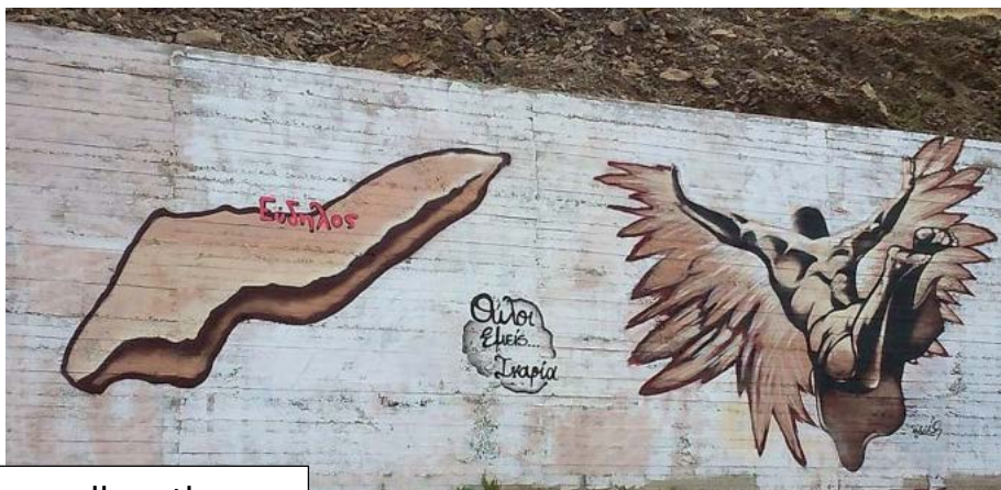
Graffiti on a wall on the island of Icarus

When the moment to escape arrived, Daedalus warned Icarus not to fly too close to the sun, but he did not listen to his father and fell into the sea when, after getting too close to the sun, the wax in his wings melted and fell apart.