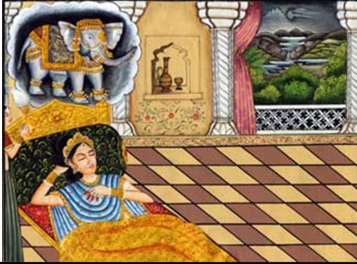
Before his birth