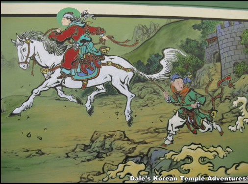
Leaving his family