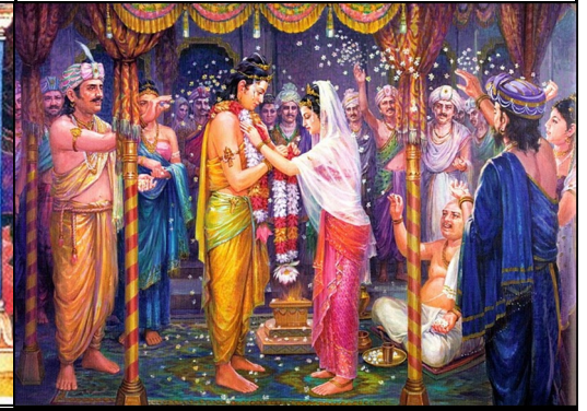
Marriage and family life