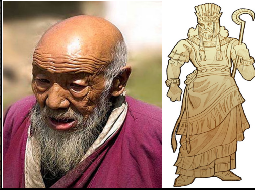
The wise man and the king