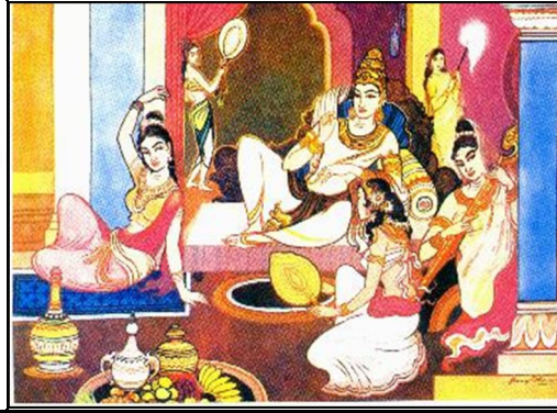
Life at the palace